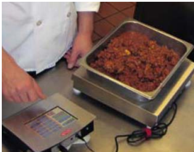
Figure 2- With just a few taps on a flatpanel the amount of waste, the food type and the reason for loss are logged

of accuracy is not necessary. What IS important, however, is presenting the simplest kind of operator interface to allow kitchen staff - often totally unfamiliar with computers and computerized tracking systems - to very quickly and easily track the wasted food without slowing down their work. To develop waste management procedures under these challenging conditions, the LeanPath executives needed to track only the most vital information: the name of the staff person discarding the food, the type of food (by a category), the weight of the wasted food to be discarded, the reason the food would be discarded (overproduction, spoilage, trim waste, or several reasons), and the tare weight of the pan or other container. The data needed to be stored for later analysis by managers and front-line staff.