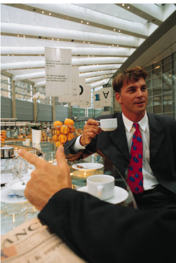
Figure 1- Will he go for the cup of soup or not? Multiply his choice by 1000 employees and you can have a waste management problem.

Ninety percent of the scales in the world are designed to reach a specified level of accuracy according to government standards for commercial transactions. The ValuWaste Tracker, which measures waste just before it is thrown away, is different. Because the Tracker weighs waste, commercial certification